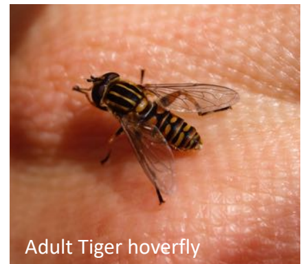
Adult Tiger hoverfly